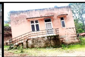
Hostel Warden Quarter