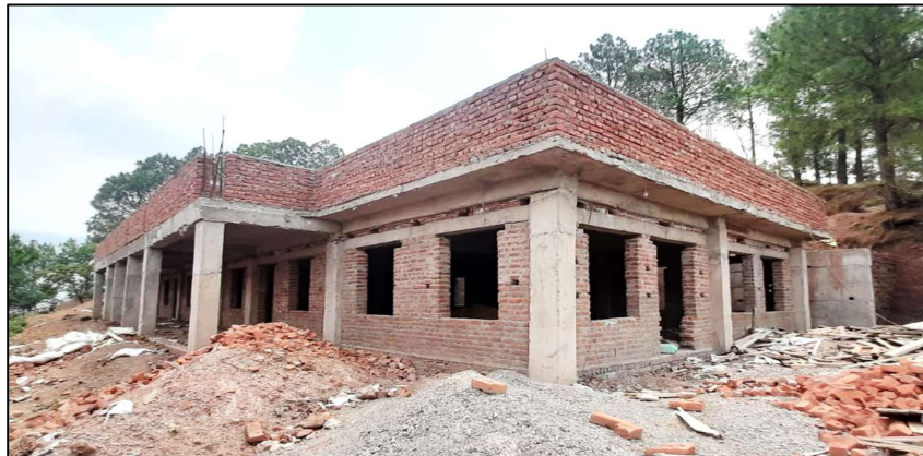
Under Construction (Geology & Psychology Labs)