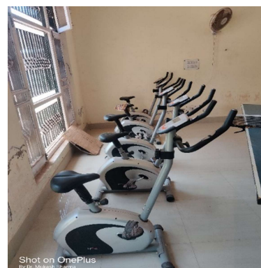
Shot on OnePlus